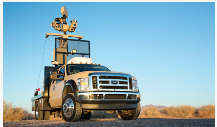
ARSS integrated on Telephonics' RaVEN®-Mobile Surveillance Capability (MSC)