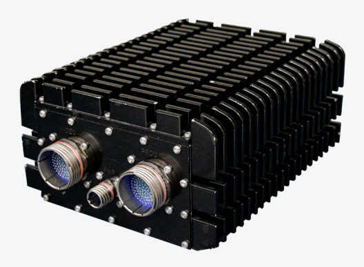
MCA External Rugged Computer