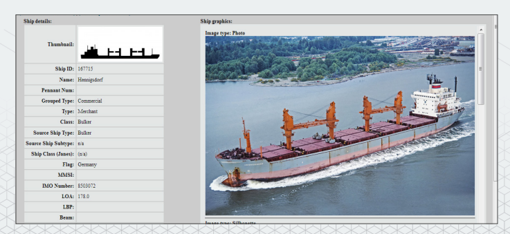
MCA ship database return