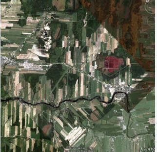
APS-143G Synthetic Aperture Radar (SAR) Stripmap comparison to Google maps.