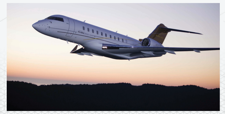
Bombardier Global 5000