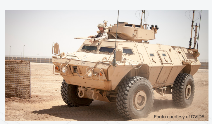
Mobile Strike Force Vehicle (MSFV)

The system offers an integrated capability for dismounted crew and personnel to maintain communications among themselves and command with Telephonics' TruLink® Wireless Intercommunication System. The simple modular configuration of the NetCom system results in