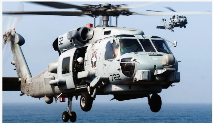
U.S. Navy MH-60R Multi-Mission Helicopter

The MH-60R, combined with the AN/APS-153(V), is designed to operate from helo-capable small combatants to the largest aircraft carriers as a key element in the helicopter-ship system. Via the aircraft's C-band data link, shipboard personnel have virtually the same radar picture as the flight crew. The radar will withstand the harshest maritime and helo-vibration environments.