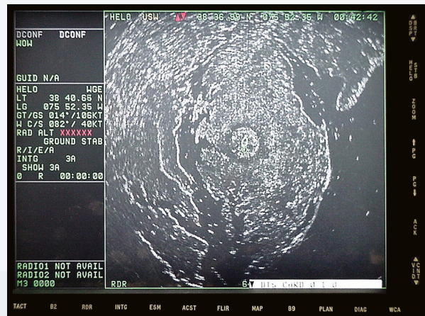
Inverse Synthetic Aperture Radar (ISAR) Imaging